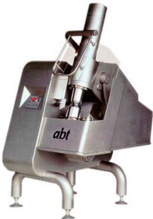
Figure 1: abt-3ML leg boning unit

After loading, the trunk is conveyed backwards, away from the operator, under the backstrap blades. These blades clear the meat from the vertebrae about 50mm either side of the centre-line. At the end of the stroke the trunk is in position for the fleecing operation to take place. The fleecing blades are introduced either side of the vertebral dorsal projections in the area just cleared, and sweep around the ribs to