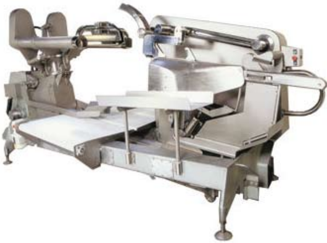
Figure 2: abt-5MT trunk boning unit

remove the meat. A second set of knives simultaneously clears tissue from the base of the neck. The trunk support is then returned to the loading position. The frame is dropped to a tray as the next trunk is being loaded. The product and skeletal frame are ejected to the left side of the machine, to be conveyed or lifted to tables for further work. Complete removal of the meat from the brisket and neck is dependent on carcass condition and pre-work.